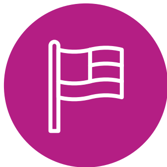
MILITARY SERVICE MEMBER